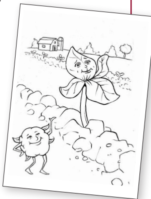
The Wonderful World of Cotton downloadable coloring book

fashion. Students can test their knowledge of cotton with a trivia quiz, and find answers to frequently asked questions about cotton's long-term sustainability. While the content is applicable to students in any part of the country, it may be particularly relevant to students in the Cotton Belt, given the economic relevance of cotton in those states. ■